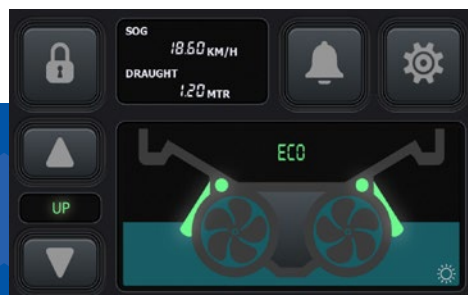
FLEX Tunnel touchscreen control panel